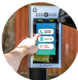
SMART SCREEN CALL MANAGEMENT