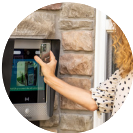
QR CODE VISITOR MANAGEMENT