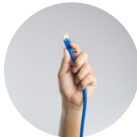
ONE STEP NETWORK CONNECTIVITY

One Step Network Connectivity ✓ Defaults to DHCP setting. No Private IP addresses required. POE compatible.