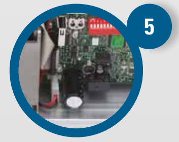
950N2 MPS CONTROL BOARD