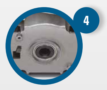
RETURN SPRING WITH TRANSMISSION ARM COUPLING