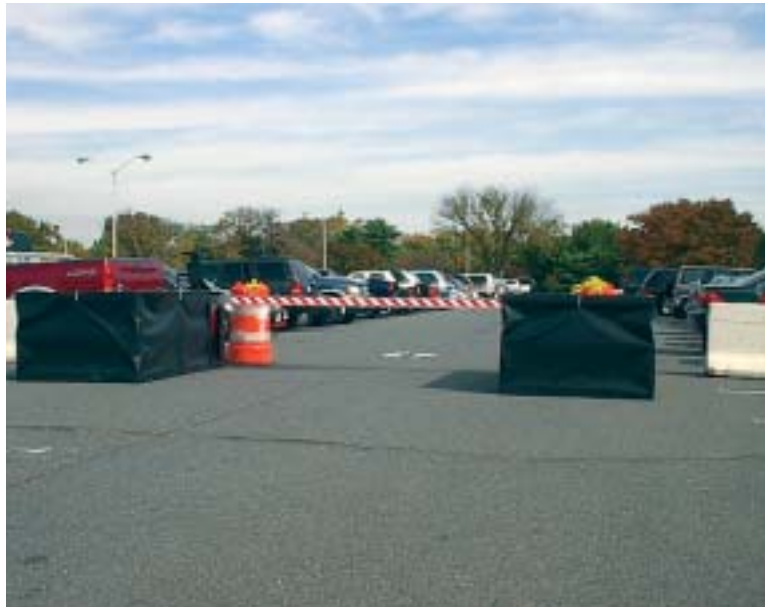
Model 712P Installed at a temporary high security parking facility

B&B ARMR's crash beams are available with several enhancement options to easily suit any user's needs. For extremely cold weather, the receiver/latch post may be equipped with a heater for uninterrupted operation, or an electromagnetic lock may be installed for additional security during unattended times. The manual unit, Model 714, may be raised and lowered by one person without the use of counter weights, and Model 712P is a portable vehicle barrier designed for fast installation in areas where a permanent barrier is not available.