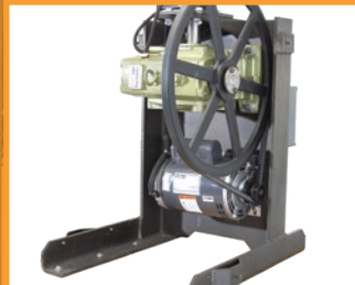
Steel Frame for strength and durability