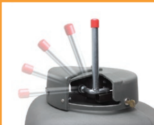
Easy to Operate manual release