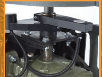
Easily Adjustable electronic magnetic limits