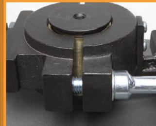
Breakaway hub prevents gearbox damage