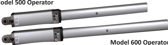
Model 600 Operator