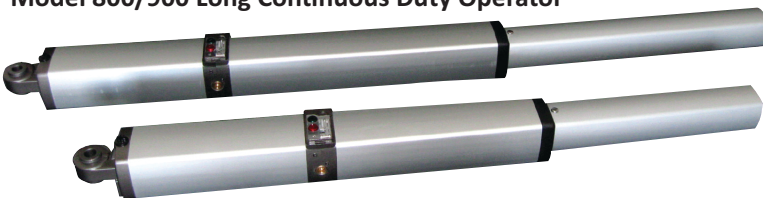
Model 800/900 Continuous Duty Operator