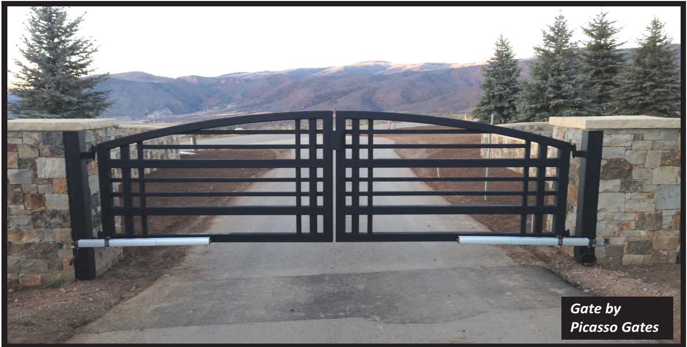
Gate by Picasso Gates

SECURITY • SAFETY • RELIABILITY • ENDURANCE