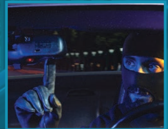
Codes Cannot Be Copied assures that only the original intended transmitters will activate the system