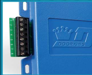
Receiver Options available to fit specific applications