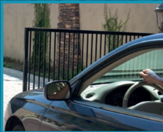
Safety/Convenience from inside your vehicle