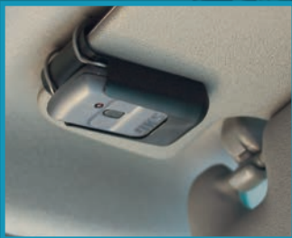
Visor Clip use to mount transmitter in vehicle

RESIDENTIAL • GATED COMMUNITIES • APARTMENT COMPLEXES • PARKING • CONDOMINIUM/RESIDENT HALL • MIXED USE • COMMERCIAL • SELF STORAGE • MAXIMUM SECURITY