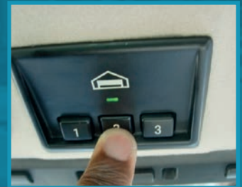
Compatible with Homelink ® system