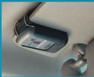
Optional Visor Clip use to mount transmitter in vehicle

GATED COMMUNITIES • APARTMENT COMPLEXES • PARKING • CONDOMINIUM/RESIDENT HALL • MIXED USE • COMMERCIAL • SELF STORAGE • MAXIMUM SECURITY