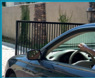
Safety/Convenience range up to 75 feet