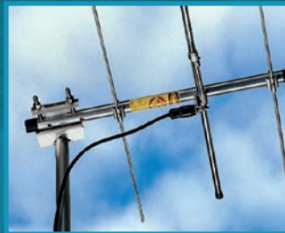
Antenna Options Directional antenna for fringe areas