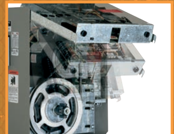
Unique Design allows easy access to all mechanical parts