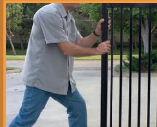
Fail-safe Release never be locked out (or in)