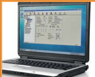
Gate Tracker™ record users access