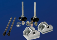
JAMB TRACK HARDWARE