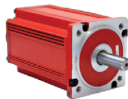
BRUSHLESS DC MOTOR CONTINUOUS DUTY 24V 1HP