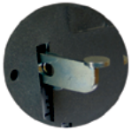
MECHANICAL FOOT PEDAL RELEASE