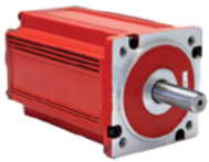
BRUSHLESS DC MOTOR CONTINUOUS DUTY 24V 1HP