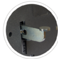
Mechanical Foot Pedal Release