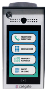
SMART SCREEN CALL MANAGEMENT