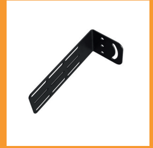
Optional: HRD-288-1 Universal Mounting Bracket