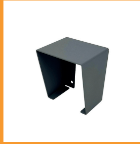
Optional: EMX-1915-1 IRB-MON2-4X2-HD-GREY