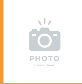
Optional: EMX-1916-1 IRB-MON2-4X2-HD-GOLD