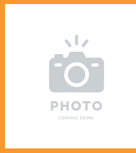
Optional: EMX-1916-1 IRB-MON2-4X2-HD-GOLD