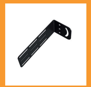
Optional: HRD-288-1 Universal Mounting Bracke