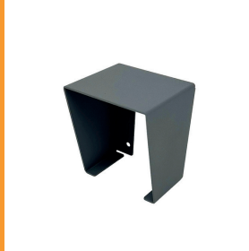
Optional: EMX-1915-1 IRB-MON2-4X2-HD-GREY