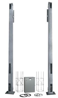
Vertical Lift Gate Operator