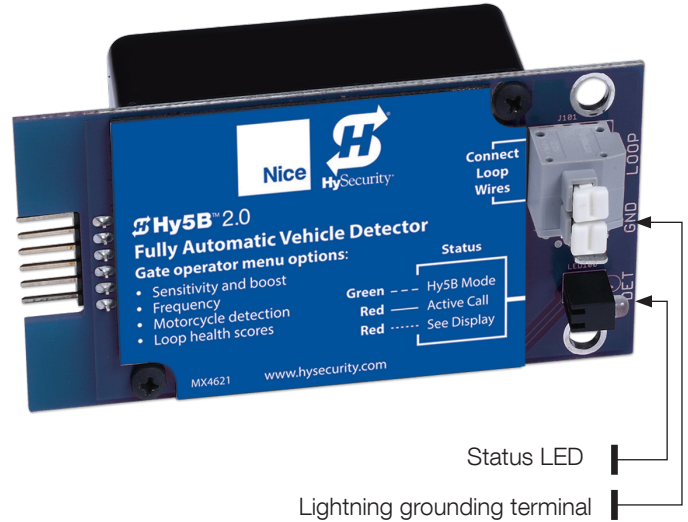
Compact design, 1-3/4 x 3-5/8 inch (4.5 cm x 9.2 cm)