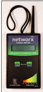
AL-NSM Signal Meter

Using the various available Modes, the AL-NSM (hereafter referred to as the " NSM ") can also measure radio noise levels, calculate overall signal quality, discover Networkx locks not yet assigned to Gateways, and even send a "locate" signal (causing all unassigned locks to "beep").