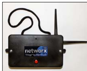
AL-NSG Signal Generator

As mentioned above, the NSM Signal Meter may be used with either an existing operational Gateway or the portable AL-NSG Networkx Signal Generator . The AL-NSG (hereafter referred to as the " NSG ") is a portable battery-powered Gateway simulation device that generates continuous Gateway radio signals to an NSM .