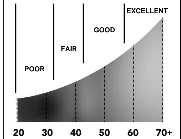
Signal strength in "DL-Windows units" (Higher Number = Stronger Signal)