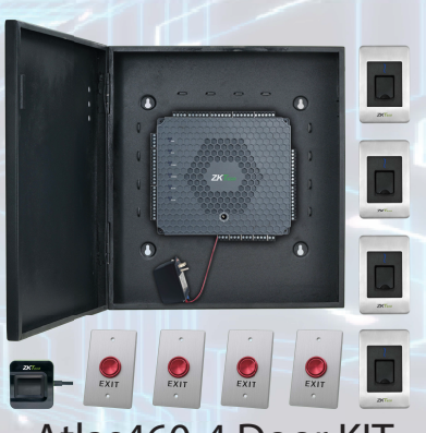
Atlas460-4 Door KIT Also available in 1 or 2 Door options