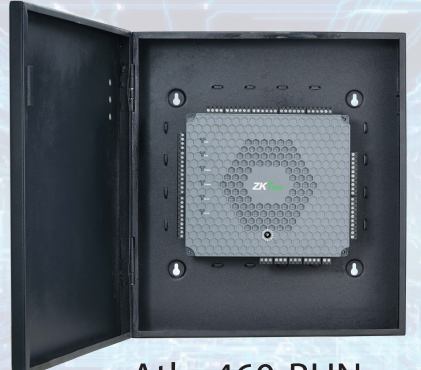
Atlas460-BUN *Also available in 1 or 2 Door options