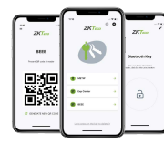
ZKey App Free Mobile app to manage user QR & BT credentials